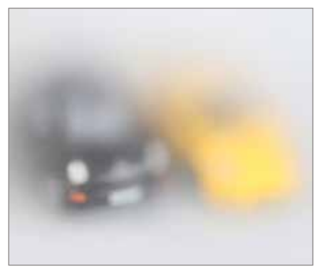
Satin Etched Privacy Glass